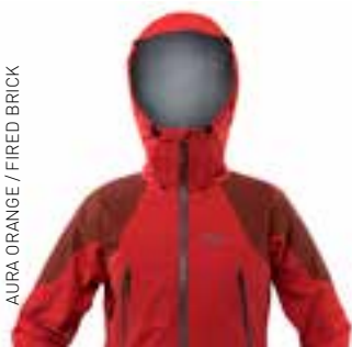
AURA ORANGE / FIRED BRICK