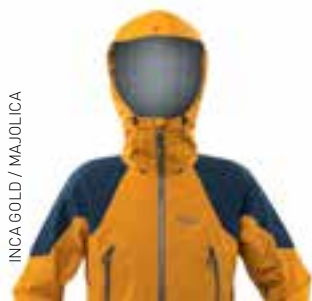
INCA GOLD / MAJOLICA