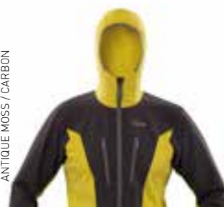
ANTIQUUE MOSS / CARBON