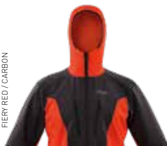
FIERY RED / CARBON