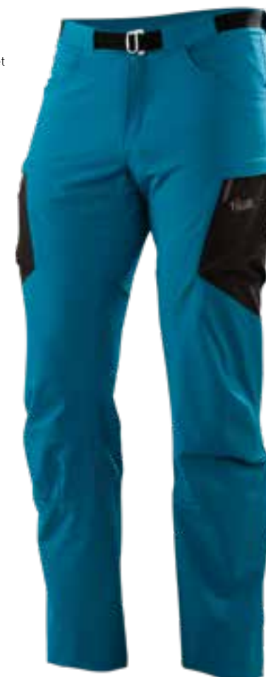
TURKISH TILE / CARBON