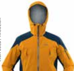
INCA GOLD / MAJOLICA