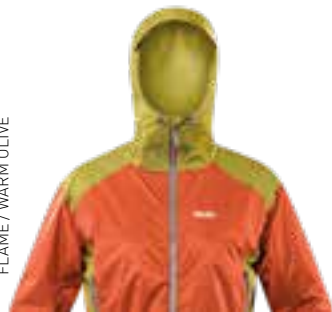
FLAME / WARM OLIVE