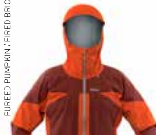
PUREED PUMPKIN / FIRED BRICK