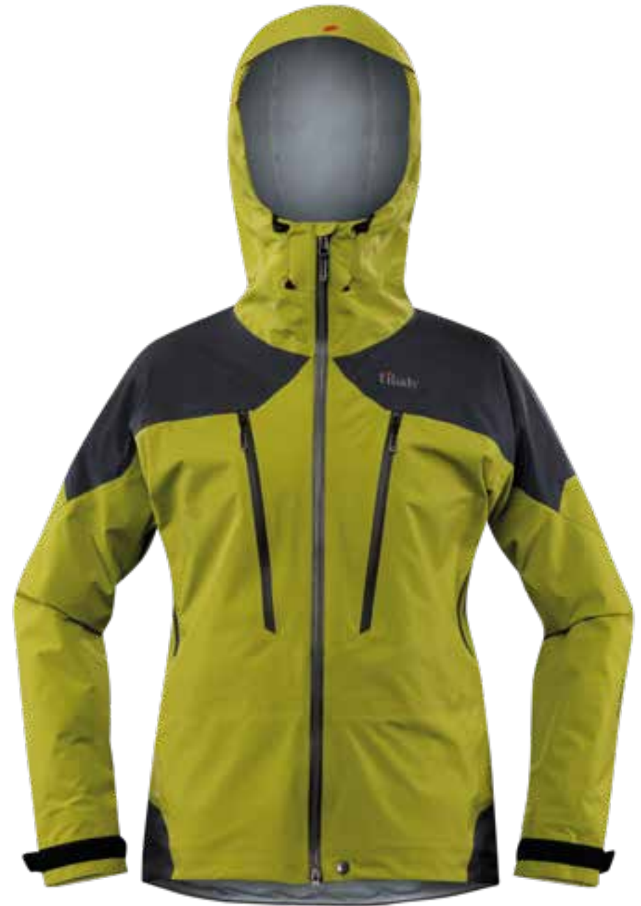
GOLDEN LIME/EBONY GREY