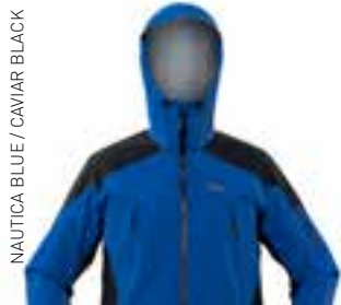
NAUTICA BLUE / CAVIAR BLACK