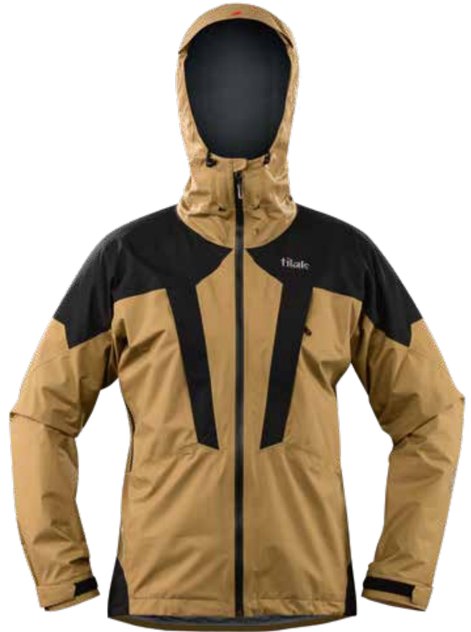
BRONZE BROWN / CAVIAR BLACK