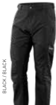
BLACK / BLACK