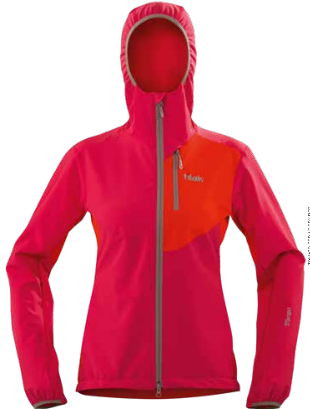
TOMATO RED / FIERY RED