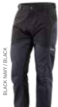
BLACK NAVY / BLACK