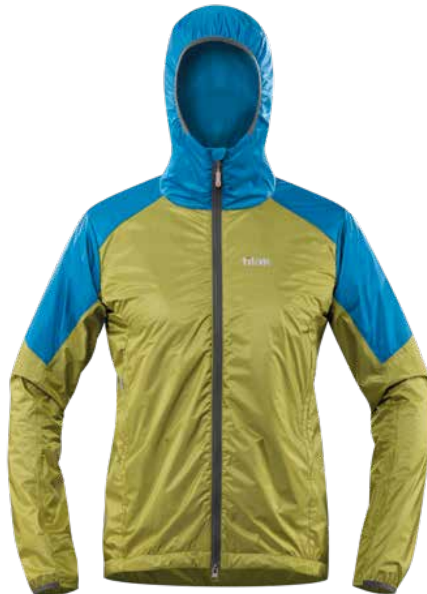
HAWAIIAN SURF / WARM OLIVE