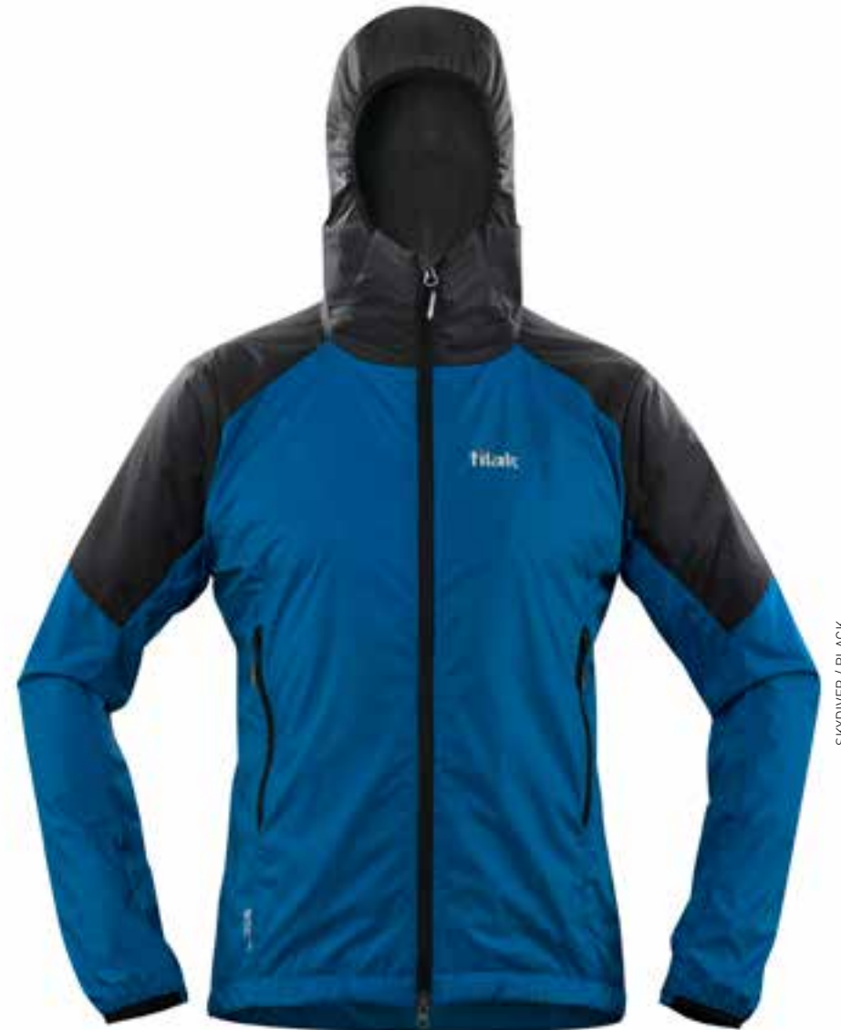
SKYDIVER / BLACK