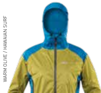
WARM OLIVE / HAWAIIAN SURF