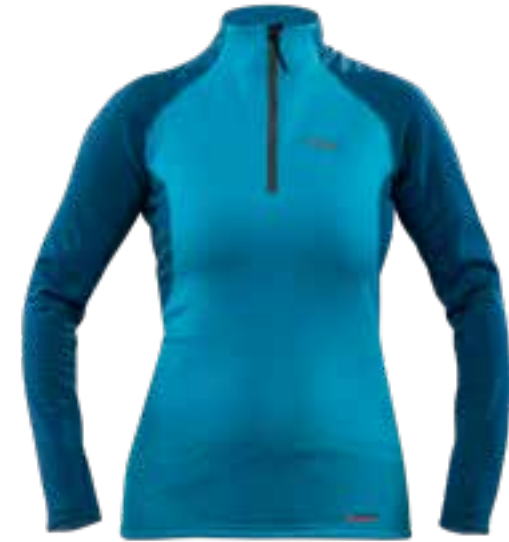
CRYSTAL TEAL / MOROCCAN BLUE