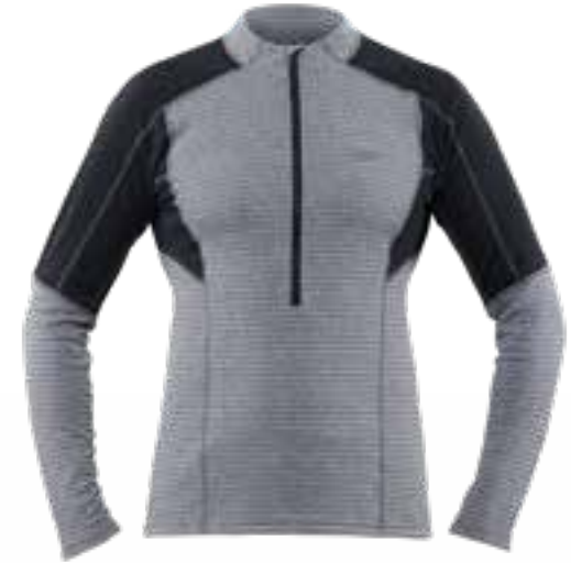
CHARCOAL / BLACK

Material: Teijin Deltapeak®TL DELTAPEAK® Weight: (M) 218 g Sizes: S M L XL XXL