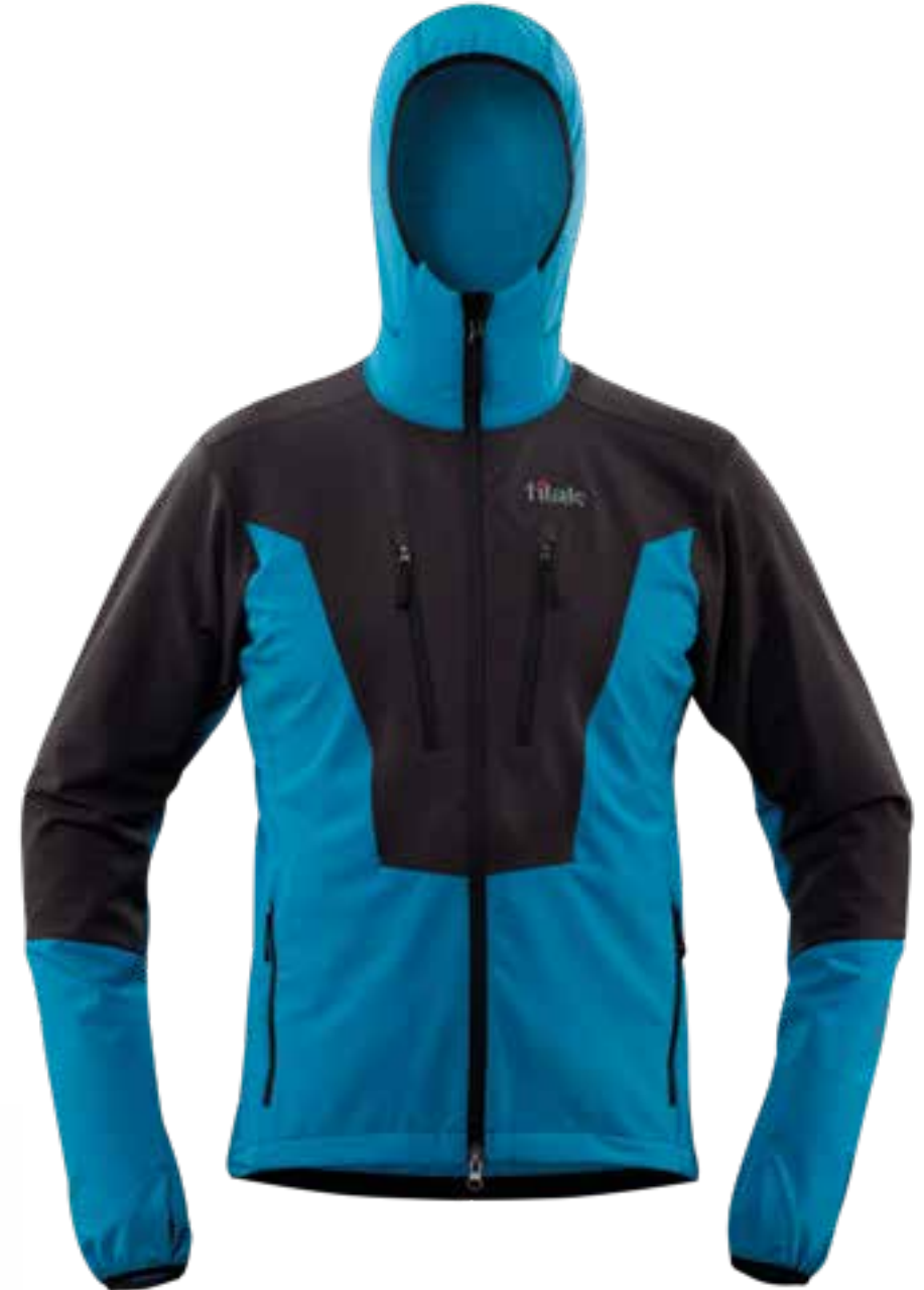
TURKISH TILE / CARBON