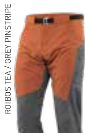
ROIBOS TEA / GREY PINSTRIPE