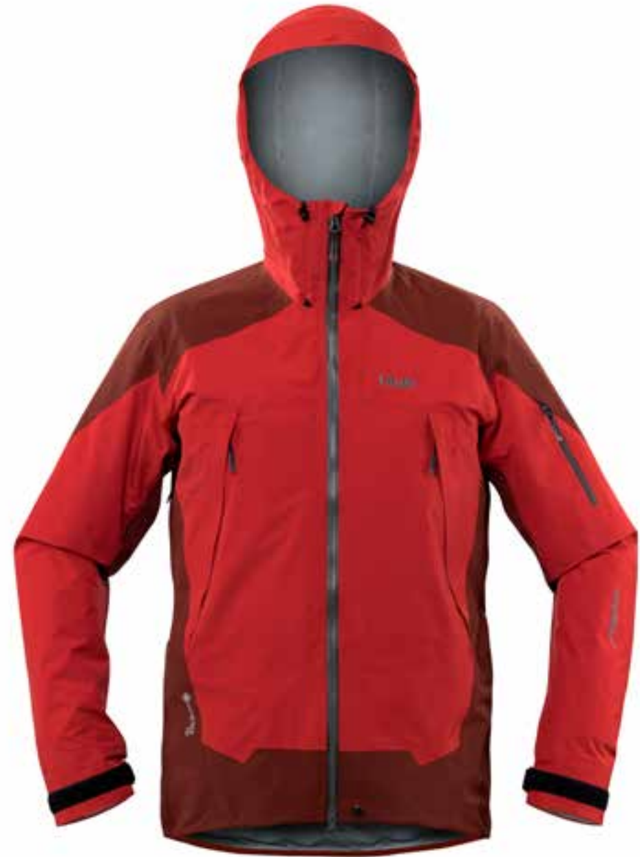
AURA ORANGE / FIRED BRICK