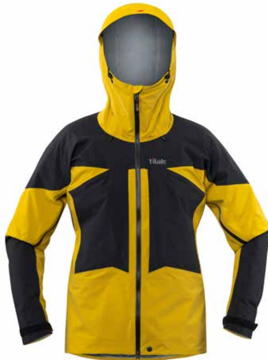
LEMON CURRY / CAVIAR BLACK