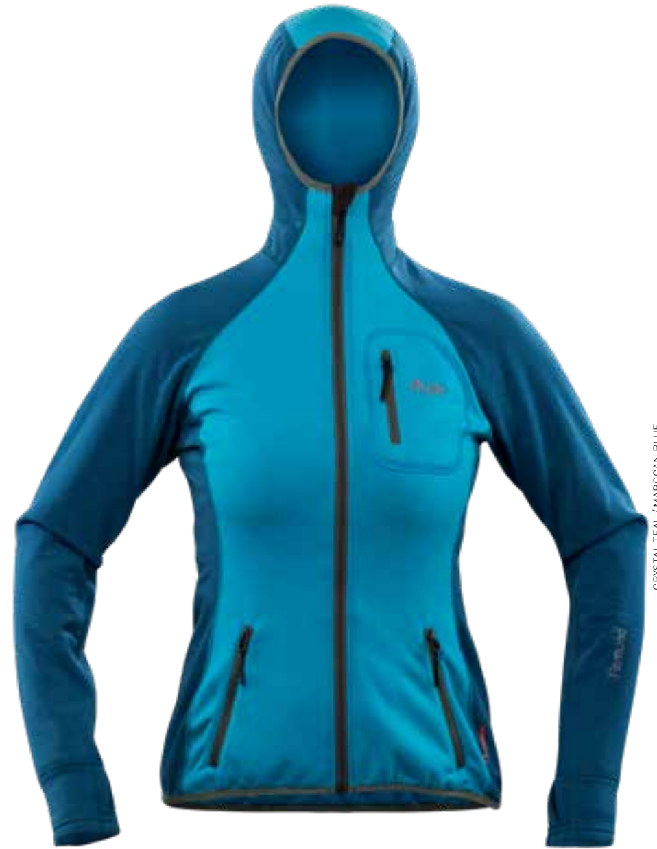
CRYSTAL TEAL / MAROCCAN BLUE