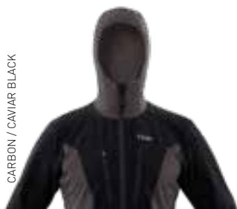
CARBON / CAVIAR BLACK