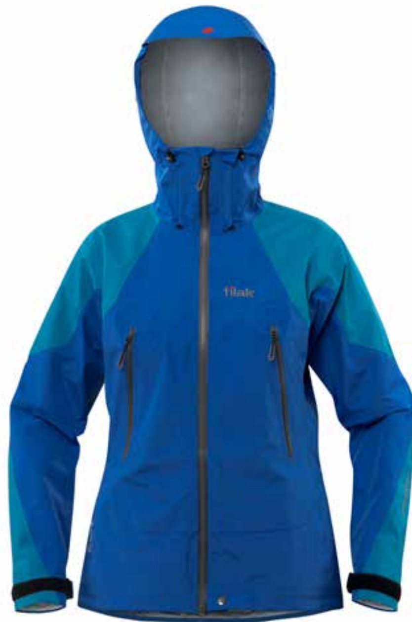
NAUTICA BLUE / TURKISH TILE