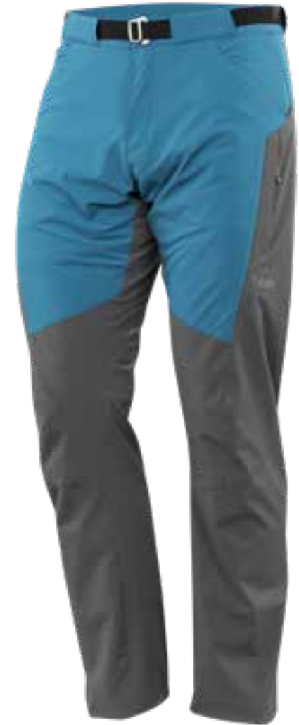
CRYSTAL TEA / GREY PINSTRIPE